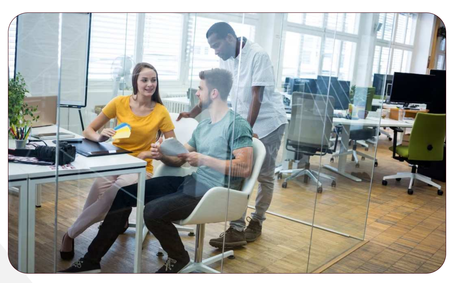
Start-up incubators & Corporate Ecosystem