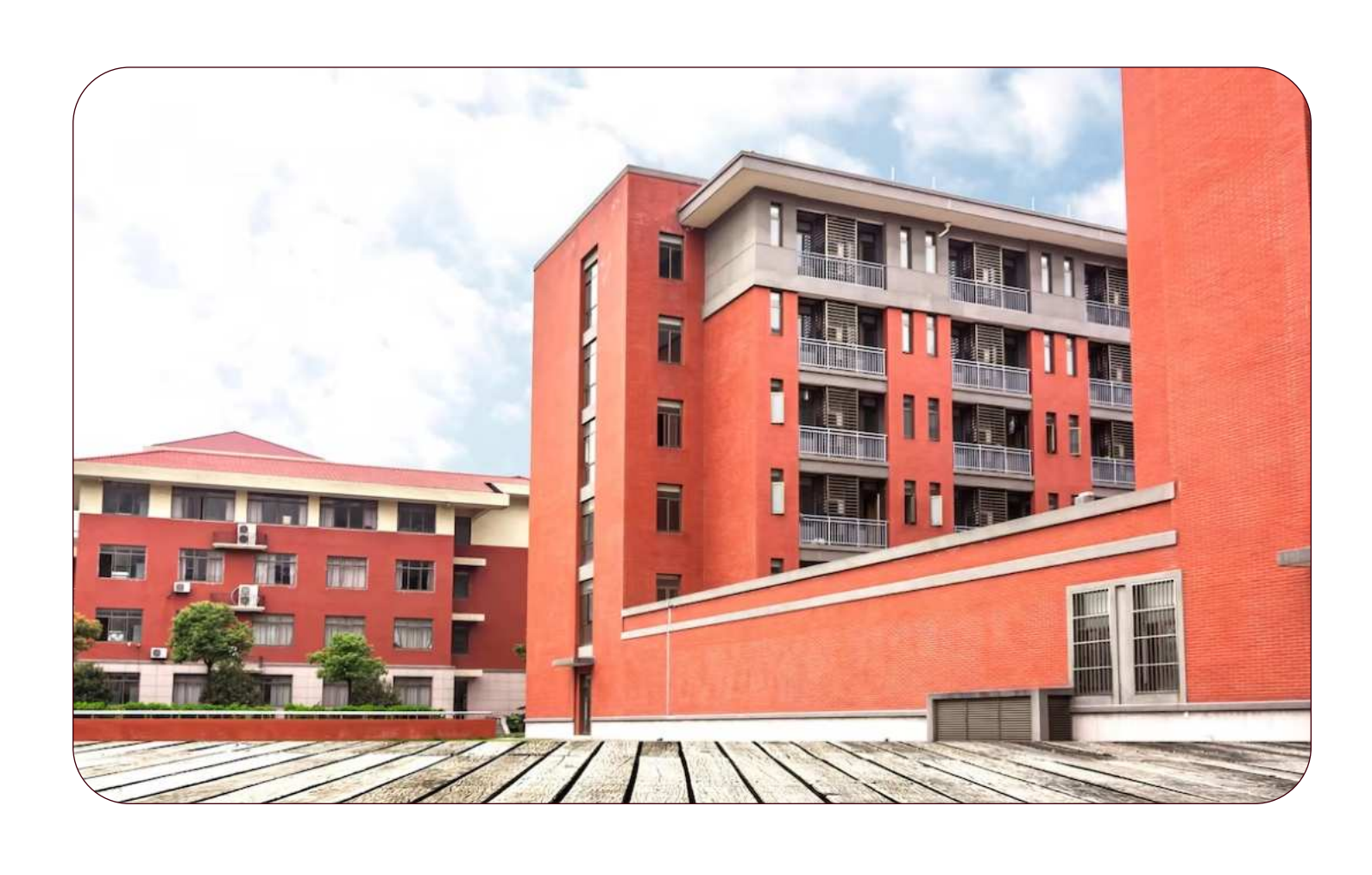
Academic Institutions & Colleges