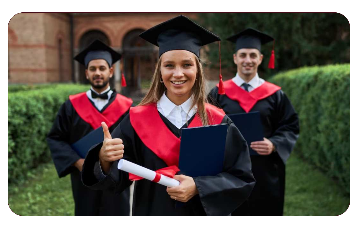
Universities & Research Parks