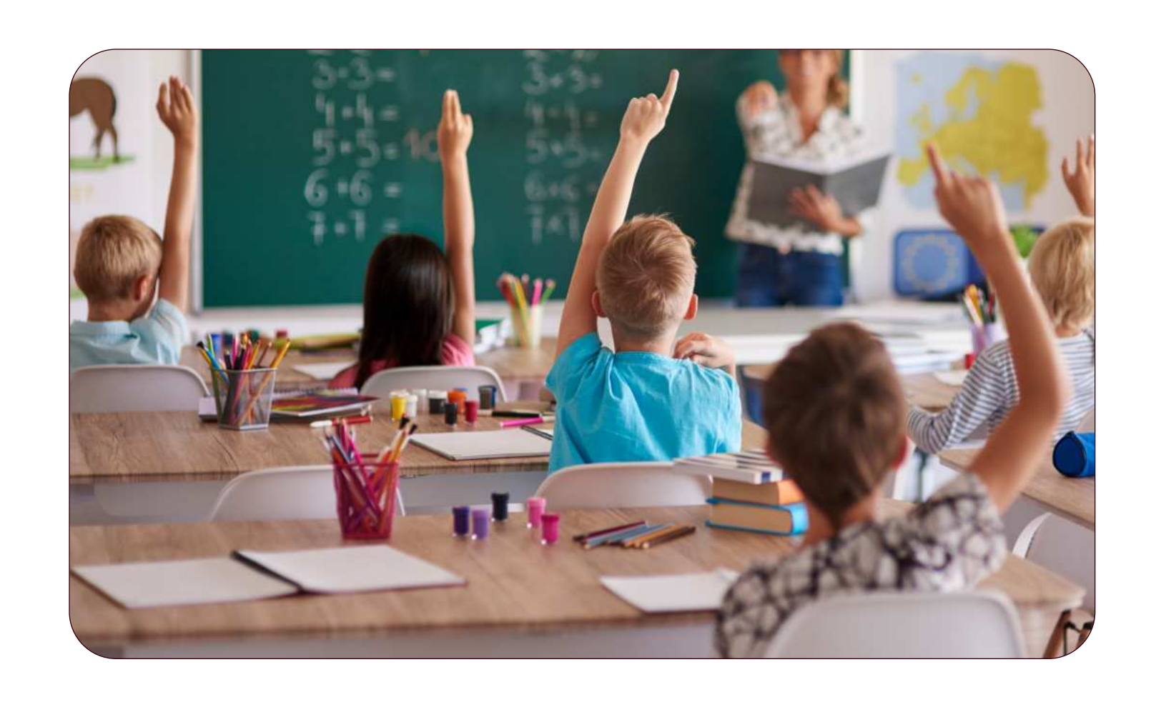
Schools & Polytechnics